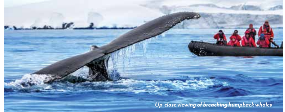
Up-close viewing of breaching humpback whales