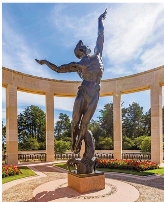
"The Spirit of American Youth Rising from the Waves," Normandy American Cemetery

From Normandy's cliff-lined coast to its breathtaking countryside, discover proud traditions, dramatic history, culinary delicacies and alluring beauty on this seven-night exploration! And as the world marks the 80th anniversary of D-Day, spend two full days visiting the D-Day beaches, the Normandy American Cemetery and other sites associated with this pivotal World War II operation. You'll also admire some of France's greatest treasures, including magnificent Mont-Saint-Michel and the finely stitched Bayeux Tapestry. Plus, look forward to a memorable lunch at a lovely castle and a Calvados tasting on a pastoral estate!