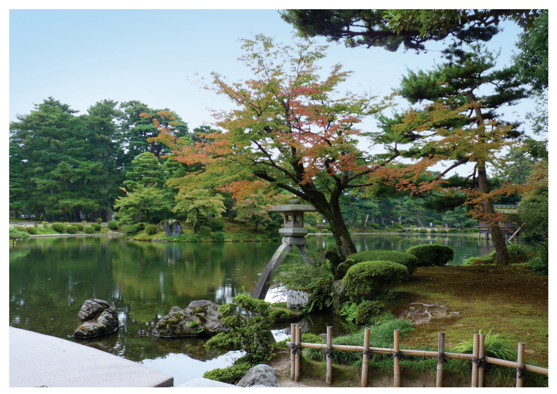
On Day 9 we visit Kenrokuen Garden, one of Japan's finest traditional gardens.

Day 6: Hakone/Takayama Today we travel first by bullet train then by Wide View Hida express train to lovely Takayama in the Japanese Alps, considered one of the country's most attractive towns with its 16<sup>th</sup>-century castle and old-style buildings. Our explorations center on three narrow streets in the San-machi-suji district where, in feudal times, merchants lived amidst the authentically preserved small inns, teahouses, and sake breweries. This afternoon we attend a traditional Japanese tea ceremony here, an historic ritual of form, grace, and spirituality. B , D