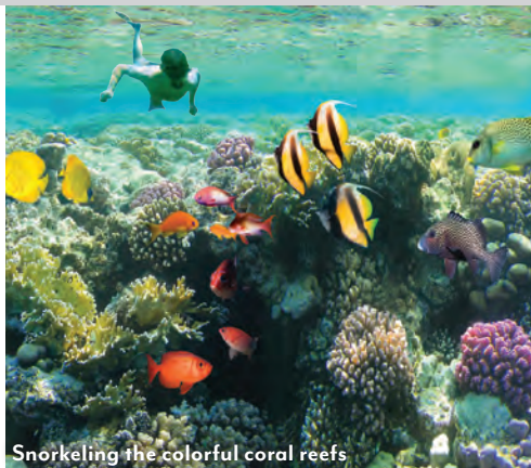
Snorkeling the colorful coral reefs