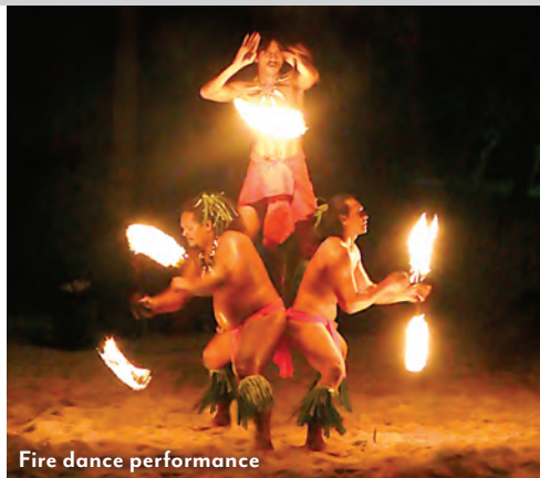
Fire dance performance