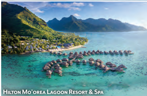
HILTON MO'OREA LAGOON RESORT & SPA

Extend your sojourn in French Polynesia for two nights and stay in the deluxe HILTON MO'OREA LAGOON RESORT & SPA. Enjoy magnificent sunrises and sunsets from your spacious beachfront or overwater bungalow. Observe abundant, colorful marine life on a reef excursion and experience the exotic fusion of fresh local seafood and French Polynesian flavors. Enjoy the hotel's overwater Toatea Bar, magnificent views, turquoise lagoons and wide array of watersports. This option includes accommodations, breakfast daily and a round-trip ferry between Tahiti and Mo'orea.