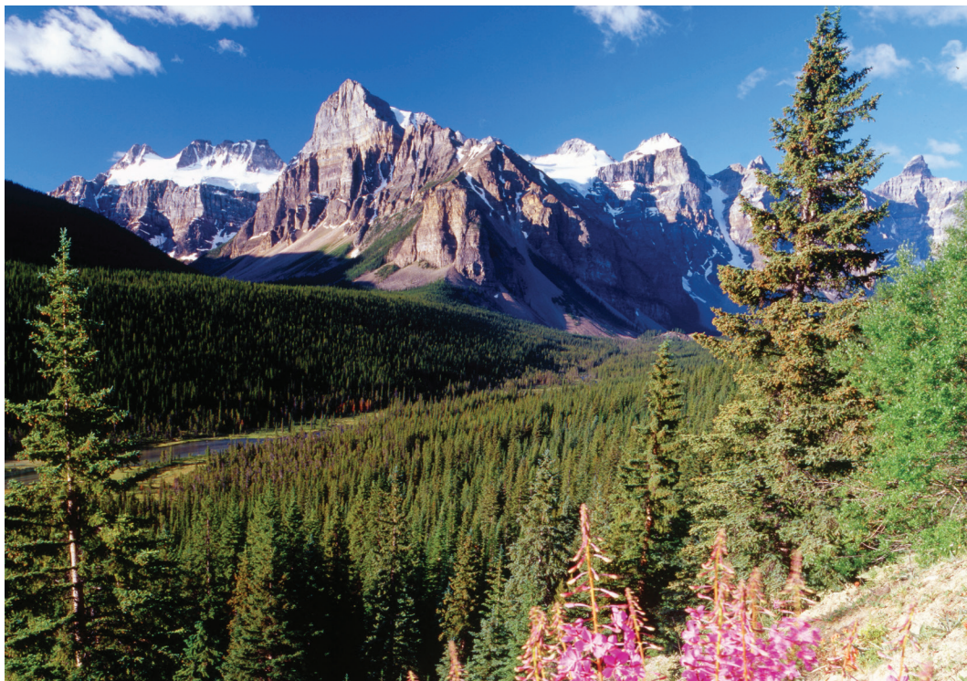
Five national parks sit within the Canadian Rockies.

winding mountain pass that offers breathtaking views and hair-raising turns. After time for lunch on our own we meet up with our motorcoach and continue southwest across the Continental Divide. After arriving late this afternoon in the resort town of Whitefish, Montana, we dine together tonight. B,D