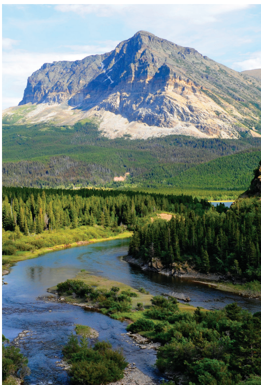
A magnificent vista in Glacier National Park