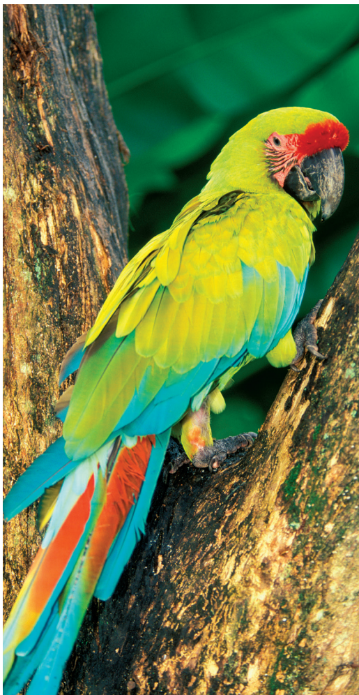
Local birdlife includes the Great Green Macaw.