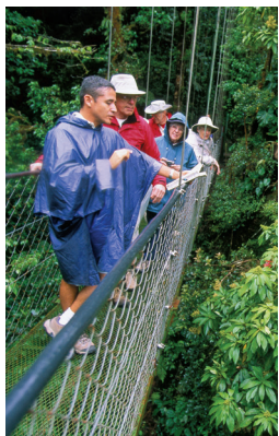
Arenal’s Sky Walk

hotel mid-afternoon, with the remainder of the day at leisure along one of Costa Rica’s most beautiful Pacific Coast settings. Dinner tonight is on our own. B,L