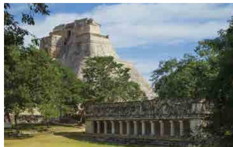
Pyramid of the Magician, Uxmal