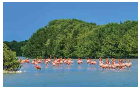
Ria Celestún Biosphere Reserve