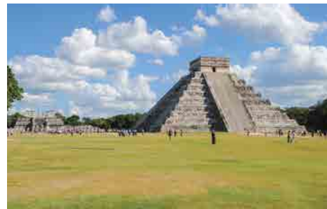
Pyramid of Kukulcan, Chichén Itzá