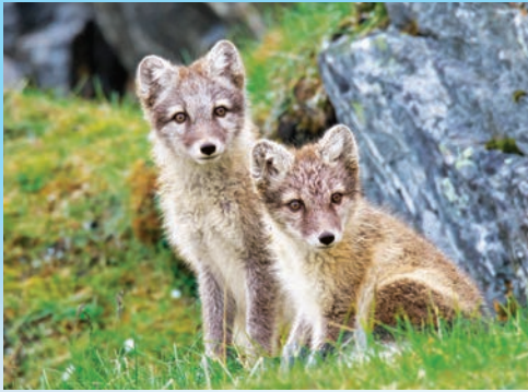
Native to the Arctic tundra biome, Arctic foxes use their acute hearing to locate prey precisely.