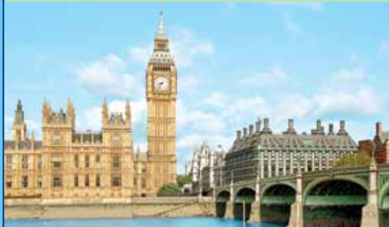
The Parliament, neighbored by 19 th -century Big Ben, was strategically built on the Thames River in 1016.

Resplendent palaces, magnificent churches and pastel-hued houses stand in testament to Lisbon's rich cultural heritage and quintessential charm. A historic gateway for world exploration and Portugal's intimate, welcoming capital, Lisbon is the ideal prelude to your cruise. Visit the UNESCO World Heritage sites of 16 th -century Jerónimos Monastery and the nearby forested village of Sintra, where the former Moorish fort is Portugal's last remaining medieval royal palace. Accommodations are for two nights in the deluxe DOM PEDRO PALACE HOTEL.