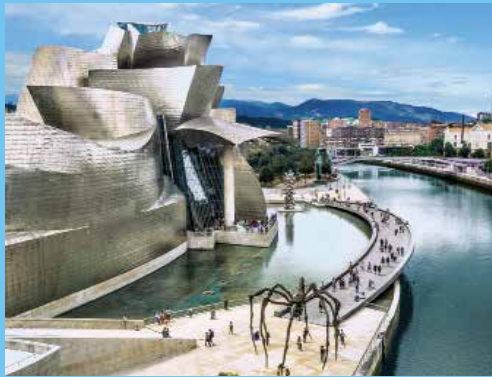
Bilbao's avant-garde Guggenheim Museum is wrapped in shining waves of titanium.

While cruising the dramatic west coast of France, attend an exclusive lecture on board by David Eisenhower .