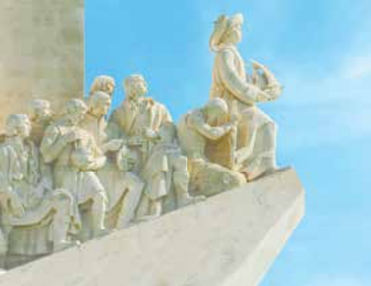
Lisbon's Monument of the Discoveries surveys the Tagus River's port and celebrates the Age of Exploration.

PRSR STD U.S. Postage PAID Gohagan & Company