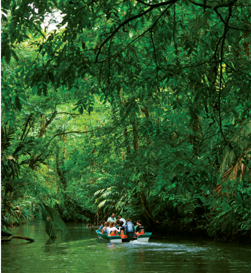
We explore Tortuguero’s canals on the pre-tour option.

Day 11: Depart for U.S. We transfer to the airport this morning for our return flights to the U.S. B