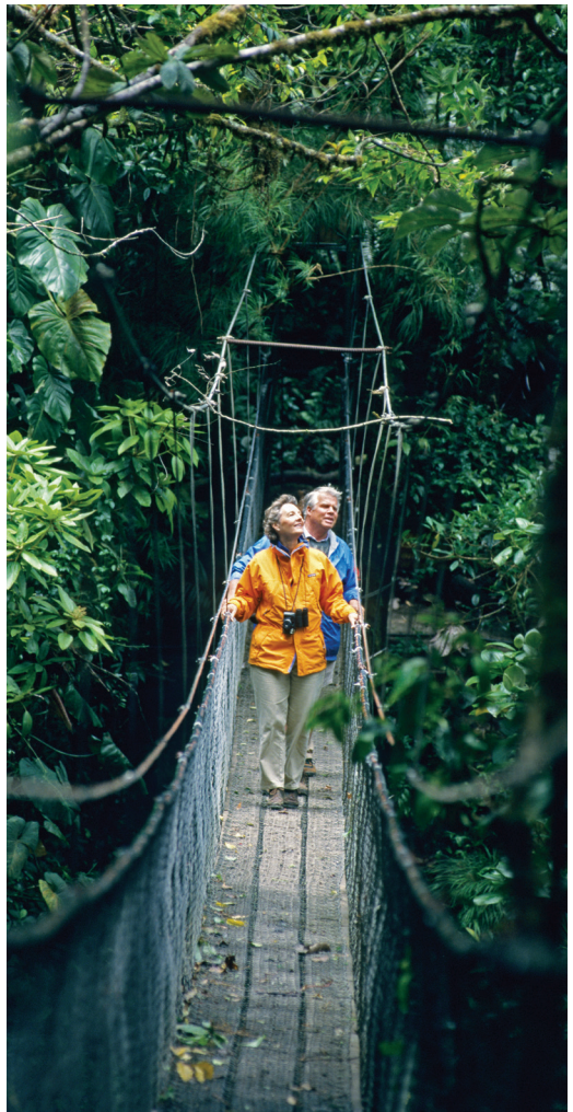
Enjoy treetop rainforest views from Arenal’s Sky Walk.