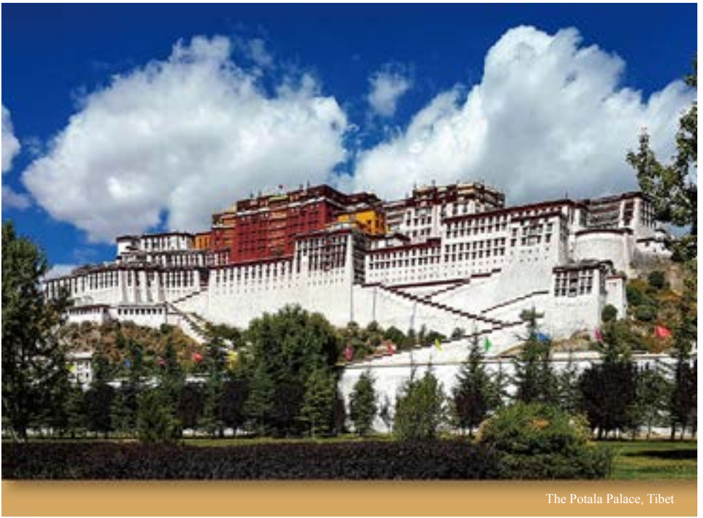
The Potala Palace, Tibet

who conquered 7 rival kingdoms and united China as one nation in 221 B.C. Visit the Great Mosque (founded in 742). Tang Dynasty Music & Dance B/L/D