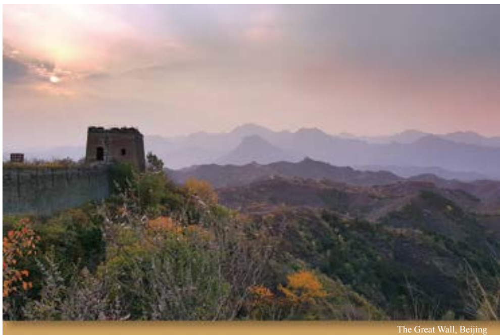
The Great Wall, Beijing