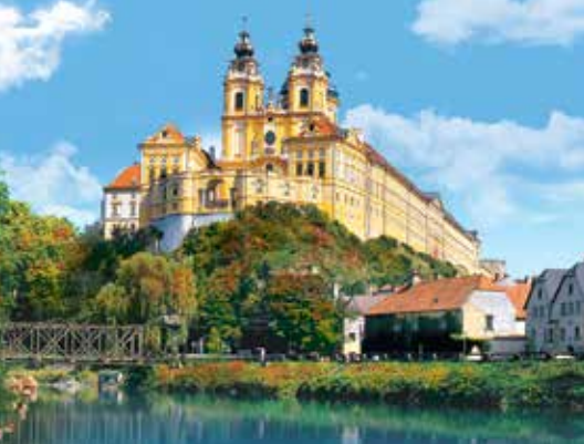
Visit beautiful Melk Abbey, founded in 1089, a former palace, and today a museum and center for learning.