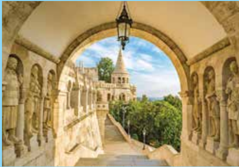
Enjoy your visit to the Fisherman's Bastion.

Visit the Romanesque, 14 th -century Cathedral of St. Martin and the elaborate Primatial Palace; see St. Michael's Gate, Bratislava's oldest preserved medieval fortification, originally built in 1300. This evening, enjoy a delightful performance of classical music on board the ship.