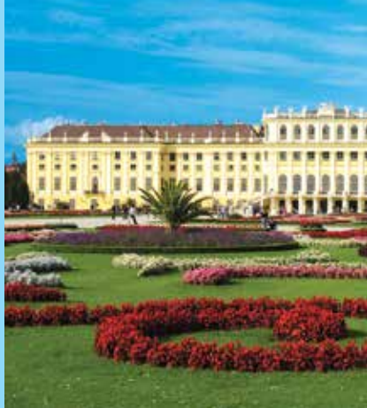
Choose to experience Rococo grandeur of Schönbrunn Palace, a UNESCO World Heritage site, an optional excursion.

A prestigious center of scholarship throughout the Middle Ages, today the abbey's library is a repository of 100,000 medieval manuscripts.