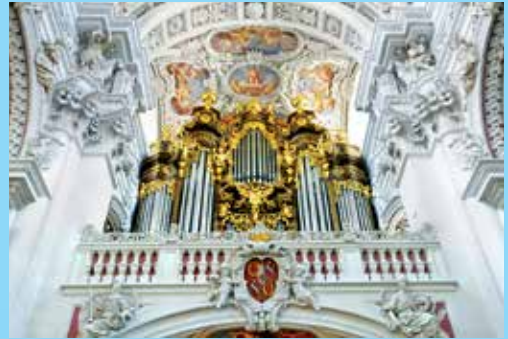
St. Stephan’s Cathedral organ is an acoustical marvel.

Embark the AMADEUS QUEEN, attend the Captain’s Welcome Reception and, following dinner, enjoy a short concert of classical music on board.