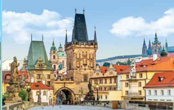
Admire the Charles Bridge and its Baroque statues, the lively streets of Prague's Old Town, or Stare Mesto, then watch the medieval Astronomical Clock.

Visit the Romanesque, 14 th -century Cathedral of St. Martin and the elaborate Primatial Palace; see St. Michael's Gate, Bratislava's oldest preserved medieval fortification, originally built in 1300. This evening, enjoy a delightful performance of classical music on board the ship.