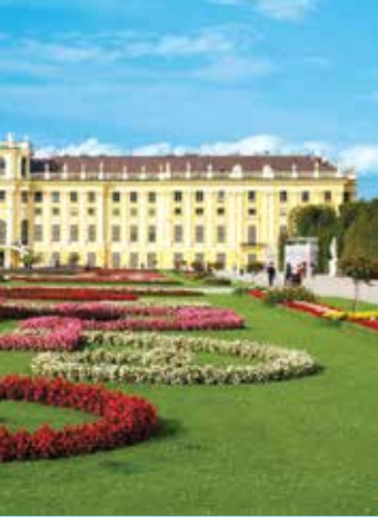
Brno Palace and Gardens, excursion.