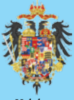
Habsburg Coat of Arms