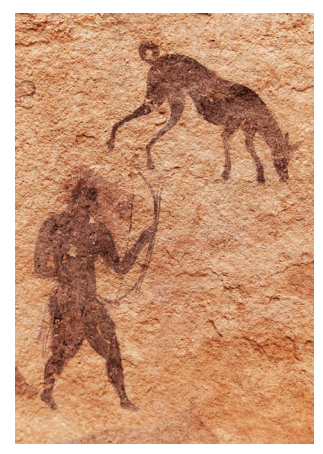
Native American petroglyphs on canyon walls

Day 10: Zion National Park We spend the day amid the wondrous natural world of Zion National Park. Despite its modest size, Zion counts as one of the most diverse national parks in the United States. Deserts and forests, rivers and canyons, buttes and natural arches all greet us here, along with numerous plant and animal species. As with most of the Southwest, the area is dominated by red-rock bluffs that show eons of sediment buildup; indeed, the rock formations here represent about 150 million