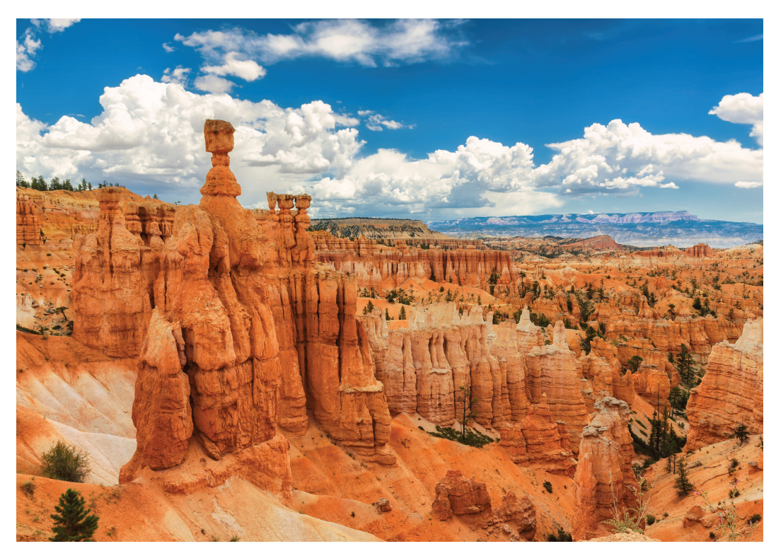
We experience Bryce Canyon's stunning natural stone pillars on Day 8.

on our own and an afternoon at leisure before we dine together tonight. B,D