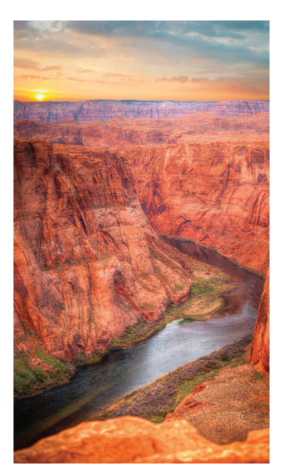
Enjoy a motorized rafting excursion on the Colorado River.